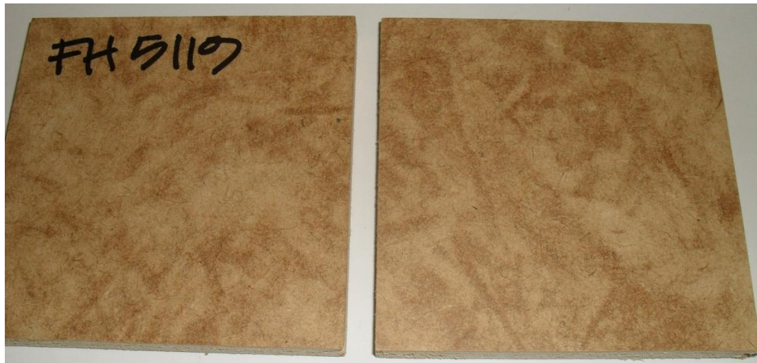
Figure 1 Representative specimen (back face on left, exposed face on right)

The product submitted by the client for testing was identified by the client as a nominal 10 mm thick Triboard. Figure 1 illustrates a representative specimen of that tested.